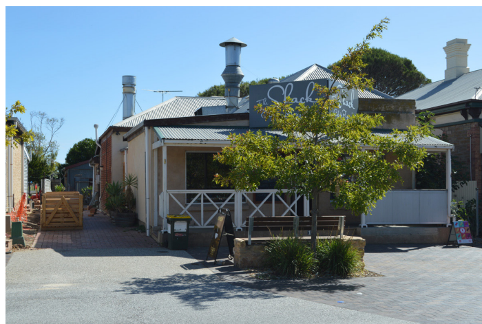
Photo – The Shack at 15 Old Coach Road

Only meat and other goods were sold in the shop as the animals were slaughtered and processed at the main premises of the Foreman butchery in High Street, Willunga. Arthur Foremen operated the butcher's shop in Aldinga from 1924 until 1937. Selina and Stella Goode owned the building for about ten years, then it was subsequently owned by the Independent Order of Rechabites, later it became Aldinga TV and it is now called "The Shack". The shop is on the City of Onkaparinga's local heritage list (#5579).