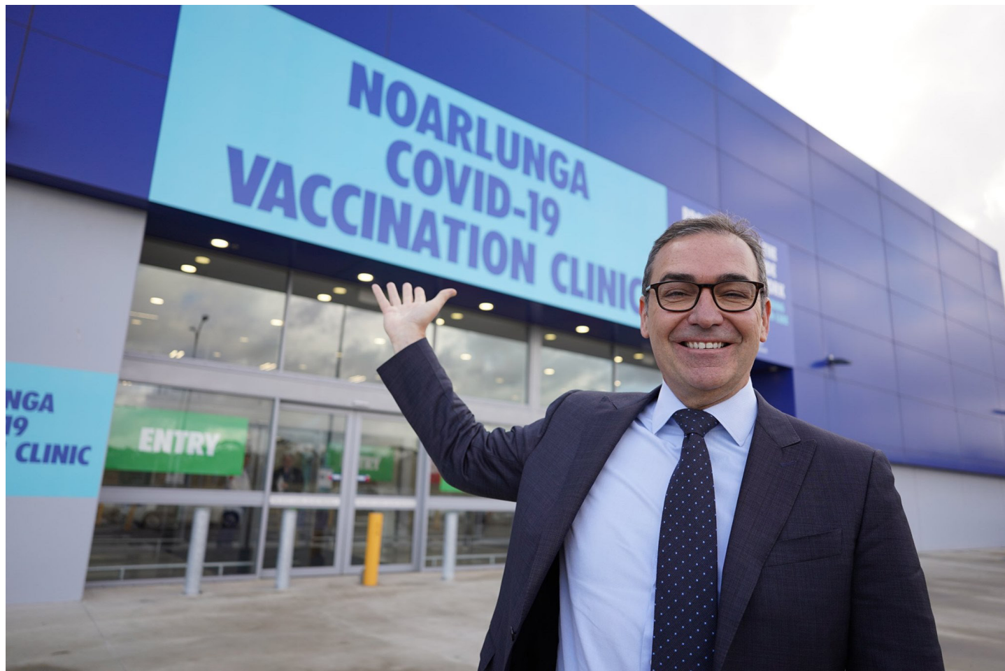
Photo: Premier Marshall at the opening of the Noarlunga Vaccination Hub

The pop-up hub, which was built on the former Master's site next to Colonades shopping centre can take as many as 5,000 vaccination appointments per week, when it reaches capacity.