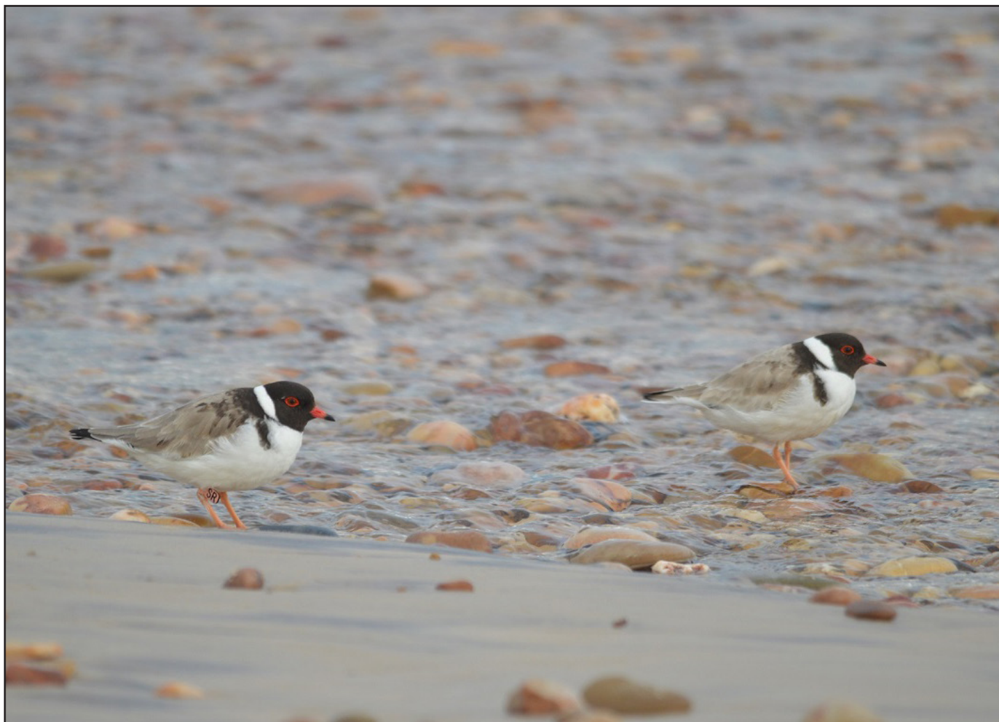
Photo: Hooded Plovers seen at the Beach